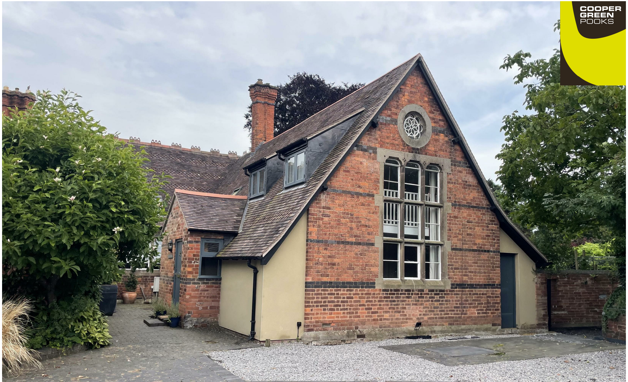
2 The Old School, Vicarage Road, Meole Village, Shrewsbury, SY3 9EZ £1,700 Per Month